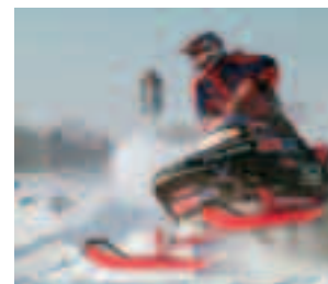
Eckstrom looks to medal again at Winter X.

The formula is simple – fans like action and winners. Team AMSOIL gives plenty of both and two great reasons for switching to AMSOIL 2-cycle oils.